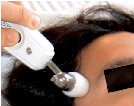
Figure 1 Use of an infrared device for measuring temporal artery temperature

by the temporal scanner in 37 patients. This gave the scanner a sensitivity to detect fever of 53% (95% CI: 41–65%) and a specificity of 96% (95% CI: 90–99%). The positive predictive value was 90% (95% CI: 77–97%) and the negative predictive value was 73% (95% CI: 64–81%). The p-value was < 0.0001.