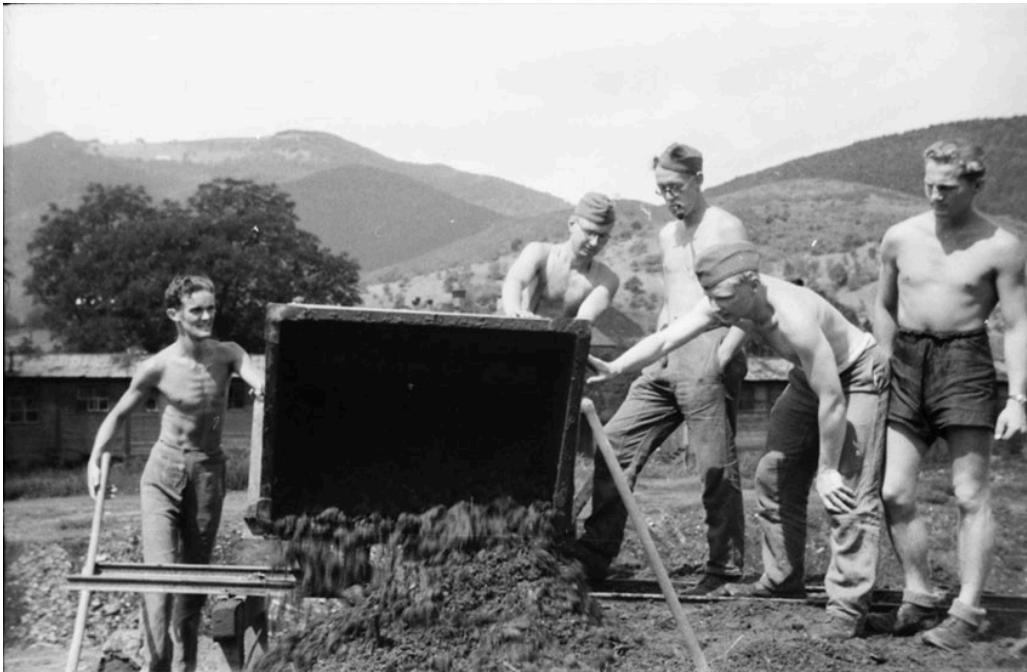
SS training camp St Andreas in Sennheim (Cernay), France. Date unknown.

The train journey to Heidelberg was dramatic. My father wrote: 'As we boarded the train, the air raid siren sounded. We knew that most attacks by the Royal Air Force tended to occur at this time. We heard the faint rumble of distant planes. The train shuddered slightly, then stopped again. Seconds felt like hours, and the rumble grew louder. Finally, the train moved, and we had been travelling for no more than a minute when we saw flashes of light and heard explosions. We could see that both Weimar and Erfurt were being bombed.' (6). The next morning they were on their way to change trains in Meiningen, but suddenly had to disembark at the wrong station, Grimmenthal. Fifteen minutes later, Meiningen was attacked. 'Luck was on our side', he wrote (6). He continued: 'The next day in Osterburken we had a frightening experience. A couple of low-flying Jabos fired a salvo from their machine guns at us. We were in the fourth carriage and escaped unharmed, but the locomotive was completely destroyed.' (6). On 4 March, they arrived in Heidelberg and had an emotional reunion with eleven fellow students they had not seen since November.