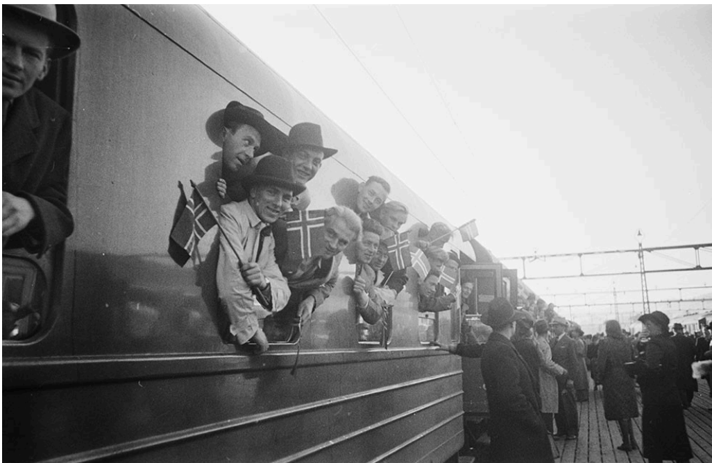
Students returning home from captivity in Buchenwald, Oslo East Railway Station (Østbanestasjonen) 1945.