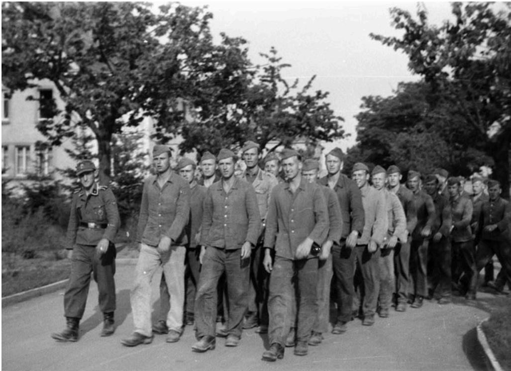
SS training camp St Andreas in Sennheim (Cernay), France. Date unknown.

Another diary entry describes how my father developed a purulent sinusitis, which he recovered from after a fellow student treated him with ephedrine. The prisoners slept head-to-toe, two to a bunk stacked three high. Up to 50 fleas could be found inside their sleeping bags in the morning (6). Flea bites often developed into erysipelas, and influenza into pneumonia. For some unknown reason, my father and his fellow medical students had a supply of 75 sulfa tablets, which proved useful in cases of pneumonia.