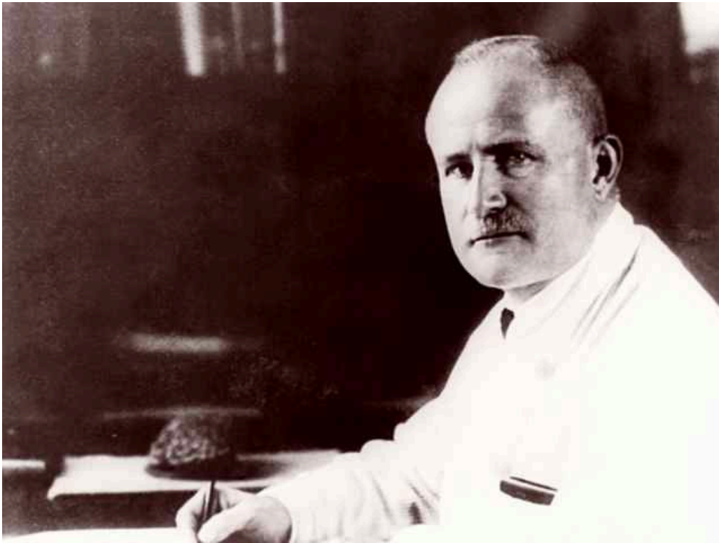
Hans Berger (1873–1941).

In earlier times, knowledge of the brain's structure and function was very limited. For example, the Greek physician and philosopher Hippocrates (approx. 460–370 BCE) believed that the brain was a phlegm-producing gland, while the influential Greco-Roman physician Galen (approx. 129–210) thought the cerebral ventricles were responsible for the brain's functions, and a blockage of the ventricles by phlegm or black bile could result in an epileptic seizure (1) .