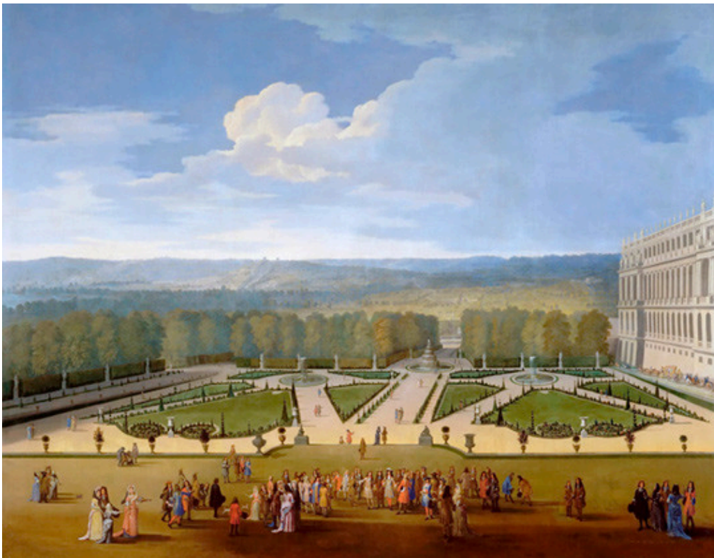
Figure 3 Louis XIV and his court taking a stroll through the park at Versailles. From Musée de l'Histoire de France, Château de Versailles.

The parties involved were already in place. His doctor, chief physician Antoine Daquin and his successor Guy Crescent Fagon (1638 – 1718), chief surgeon Félix as well as four apothecaries had arrived at five in the morning through different doors, so as not to arouse suspicion. The king had been administered a pre-operative enema. He appeared to have his nerves under control and took a great interest in the various instruments that were to be used.