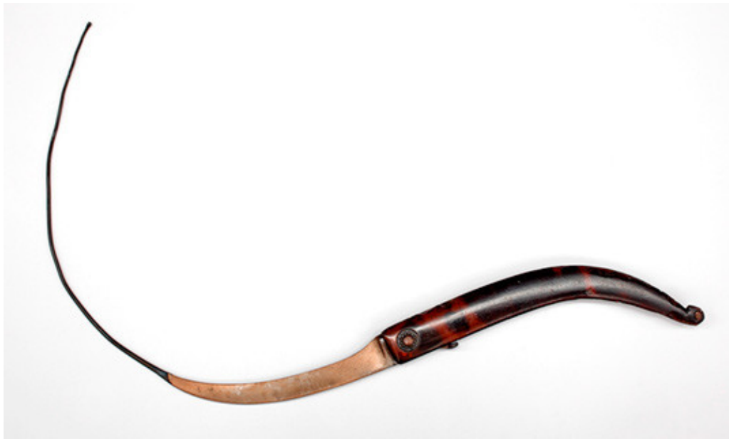
Figure 2 This instrument – a scalpel with royal curvature – was developed for operating on Louis XIV.

finding the correct type of instrument. He gradually developed the instrument that was used on the Sun King, called «le bistouri royal» (the royal probe). This was a long, curved silver probe, now on display in the medical history museum in the rue de l'École de Médecine (Medical School Street) in Paris (Figure 2).