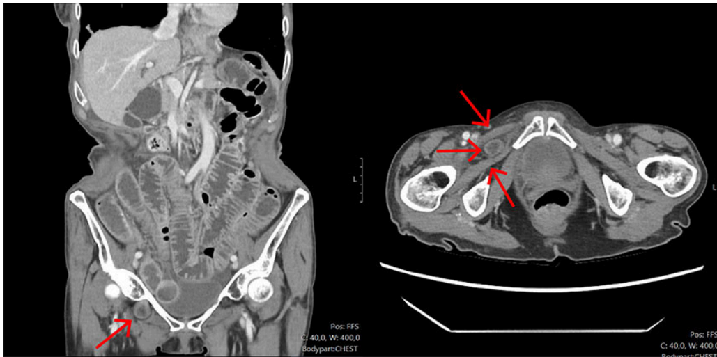
Figure 1 CT of the abdomen with intravenous contrast (axial and coronal planes) on day four after the initial admission showed dilated small bowel loops and an incarcerated obturator hernia in the right groin, located between the pectineus muscle and the external obturator muscle (indicated by the arrows).

During laparoscopy under general anaesthesia, an incarcerated small bowel loop was found in the obturator canal, consistent with the CT findings (Figure 2a). The bowel was carefully reduced, with no signs of necrosis or perforation. After the hernia was reduced, the patient experienced hypotension, with blood pressure of 98/37 mmHg. Intraoperative arterial blood gas analysis showed pH 7.22 (7.36–7.44), PCO_2 (a) 7.0 (4.7–6.0 kPa), PO_2 (a) 15.0 (> 8.7 kPa), HCO_3^- 19 (22–26 mmol/L), base excess -6.6 (-1.9–4.5 mmol/L), Cl 104 (98–107 mmol/L), and lactate 1.0 (0.4–1.3 mmol/L), consistent with mixed respiratory and metabolic acidosis. The hypercapnia was presumed to be caused by perioperative absorption of insufflated CO_2 gas from the peritoneum into the capillary network. Norepinephrine infusion was initiated at 0.04 mcg/kg/min, and minute ventilation was increased to correct the acidosis. The reduced small bowel segment was re-evaluated and was considered still viable, with no need for resection (Figure 2b). The hernia defect was closed with primary sutures using non-absorbable, knot-free monofilament barbed suture (V-Loc) (Figures 2c and 2d) to minimise surgery time due to the patient's deteriorating condition.