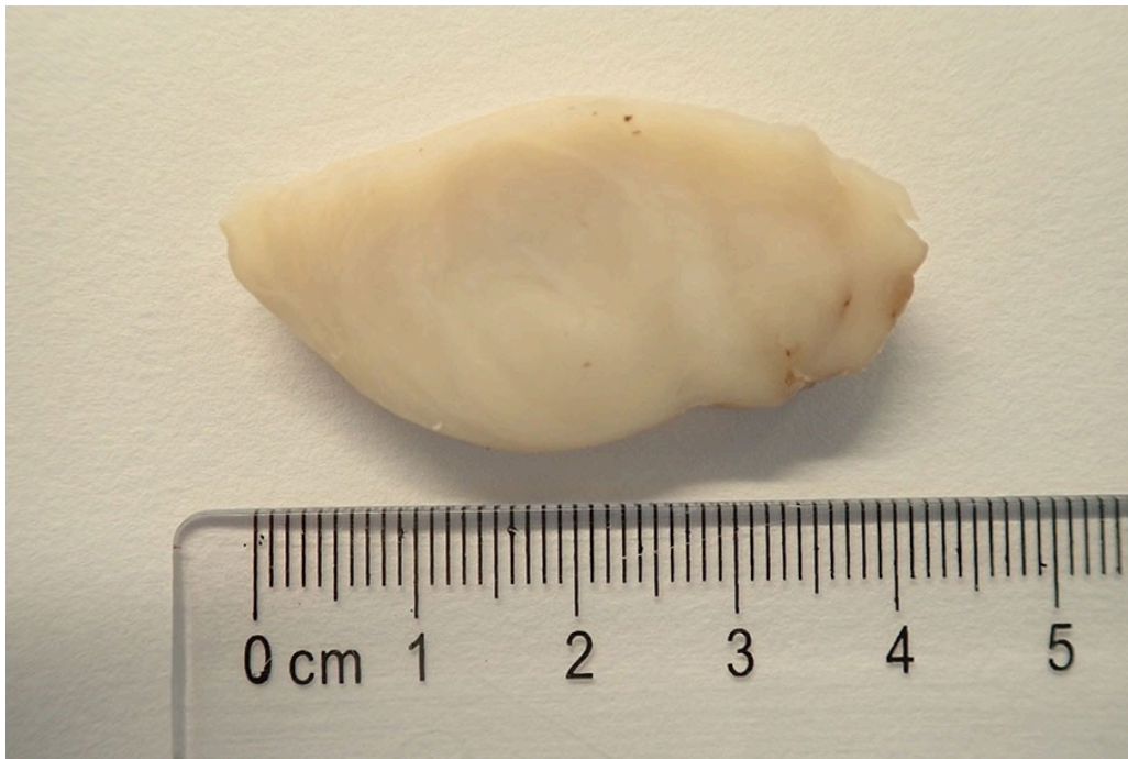
Figure 1 Well-defined tumour tissue with greyish white cross-sectional surface

Macroscopic examination showed a well-defined, smooth-surfaced nodule measuring 5 \times 4 \times 2 cm and weighing 23 g. Figure 1 shows the greyish-white solid cross-sectional surface seen on dissection of the tumour. Microscopic examination revealed fascicles of spindle-shaped cells with eosinophilic cytoplasm and elongated nuclei without prominent nucleoli (Figures 2a and 2b). There was little mitosis, and necrosis was not detected. This was consistent with a benign tumour. Immunohistochemically, the tumour cells were homogeneously positive for desmin (Figure 2c) and to a lesser degree for DOG-1, consistent with smooth muscle differentiation. There was low proliferation (Ki-67 < 5 %). SOX10, S-100, CD117 and CD34 were negative in the tumour tissue. This result ruled out a tumour with neurogenic differentiation (for example schwannoma) or a gastrointestinal stromal tumour (GIST) outside the gastrointestinal tract, which were considered histological differential diagnoses. The nodule was surrounded by scant collagen fibre with capsule-like appearance. This finding confirmed the clinical assessment that the tumour had been removed in its entirety.