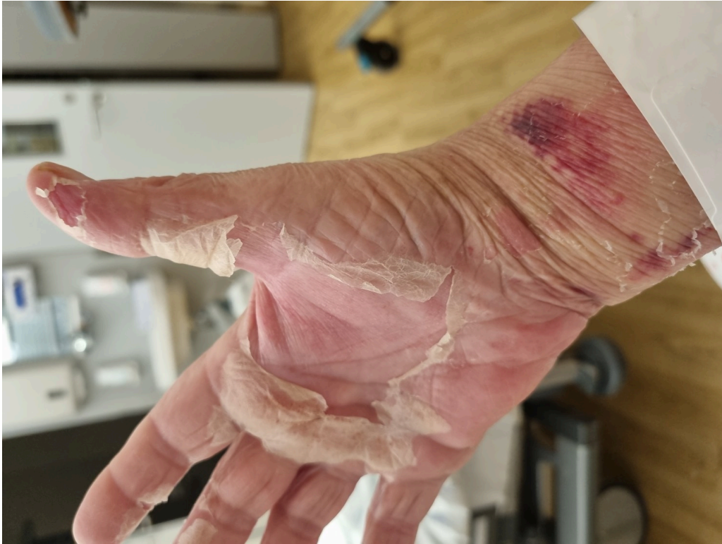
Figure 1 Desquamation of the palm

The day after transferral, we also observed that the rash had spread to the whole body, and the skin on the palms of the hands and soles of the feet were starting to peel (Figure 1). The patient's medical history and clinical presentation led us to consider toxic shock syndrome. Despite only mild redness around the surgical wound on the breast, the breast surgeon decided to open and revise the wound under local anaesthesia in the ICU. There was no visible pus or fluid accumulation in the wound, and the tissue appeared healthy. Samples were taken from the wound for cultures, and the skin was only partially closed to allow any potential fluid to drain out.