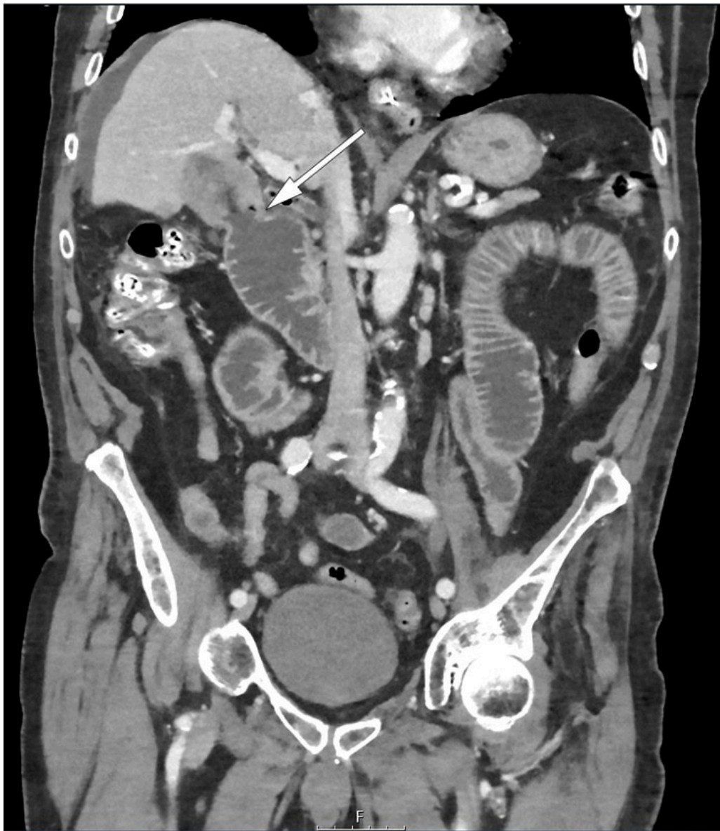
Figure 2 CT, coronal section. The arrow indicates a fistula between the gallbladder, which has abnormal wall thickening, and the duodenum. The duodenum and jejunum are distended and fluid-filled. Visualised segments of the ileum are collapsed. Free fluid in the subphrenic space on right side.

Our patient had a non-radiopaque concretion that was barely visualised on CT. Ultrasound revealed a clear concretion that cast a shadow, and based on the ultrasound findings the outline of this could just be made out on plain abdominal film. A repeat CT scan also revealed air in the biliary tree and cholecystoduodenal fistula (Figure 2). A large concretion in the gallbladder could be discerned on CT images from four years previously, but no fistula or tumour.