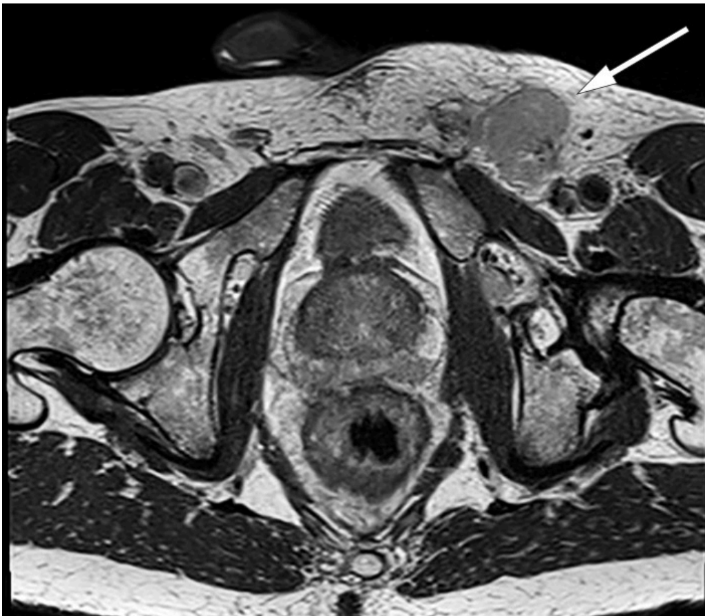
Figure 2 MRI, axial view of pelvis, with enlarged lymph node in left inguinal region (arrow).

Men who have sex with men are at increased risk of anal cancer (1). The clinical and radiological findings suggested anal cancer with spreading to regional and non-regional lymph nodes, but none of the biopsies showed evidence of malignancy. Suspecting that the initial biopsies might not have been representative, we decided to re-biopsy both the tumour and the pathological left inguinal lymph nodes under general anaesthesia. The clinical significance of the intestinal spirochaetosis in the rectal mucosa was unclear. We therefore consulted a specialist in the Department of Venereology (Olafia Clinic) who, on the basis of the symptoms and clinical findings, suggested that sexually transmitted infections could be among the differential diagnoses. It was therefore agreed that the patient would be referred for assessment in the Department of Venereology in parallel with further testing for malignancy. We were advised by the venereologist to send parts of the biopsies to be tested for Neisseria gonorrhoeae , Treponema pallidum , Chlamydia trachomatis , Lymphogranuloma venereum and Mycoplasma genitalium .