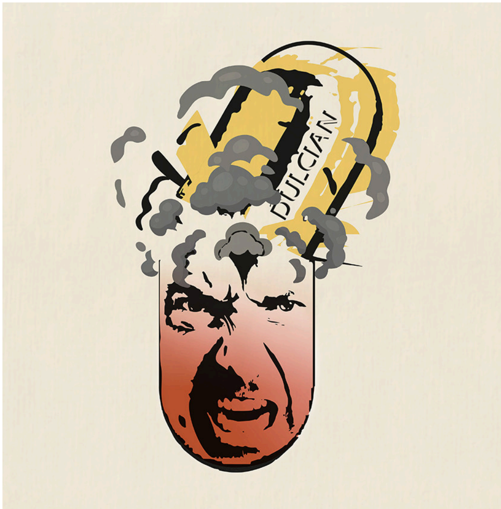
Figure 1 The fictional Dulcian pill.