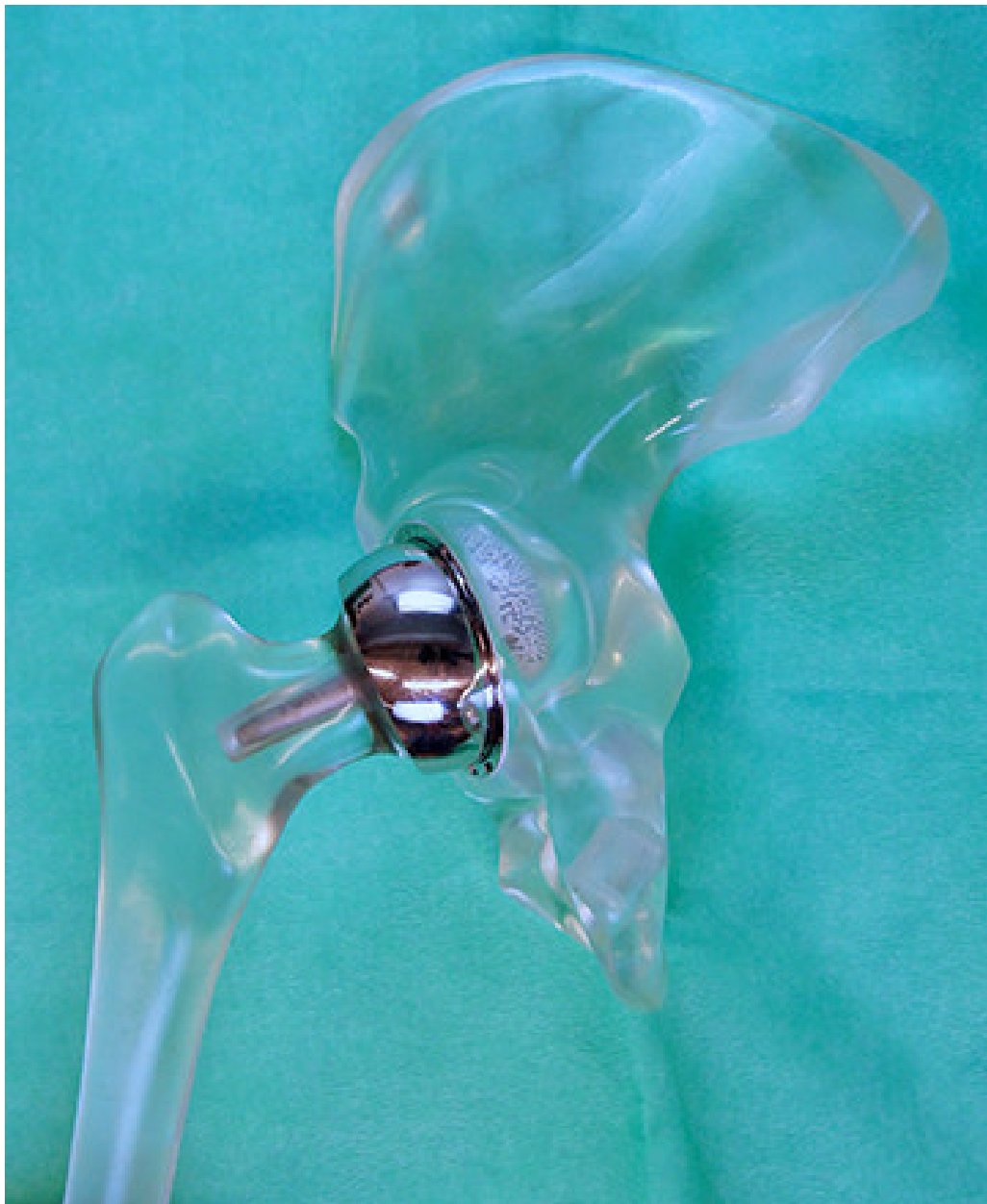
Figure 1 A Birmingham hip resurfacing prosthesis (Smith and Nephew, Warwick, England), implanted here in a hip model, has metal-on-metal joint surfaces where the 'cup' and 'head' consist of a cobalt-chromium-molybdenum alloy with 66 % Co, 26.5–30 % Cr, 4.5–7.0 % Mo, <1 % Ni, Mn and Fe, and <0.35 % C, in accordance with ISO standard 5832.

According to the Norwegian Arthroplasty Register, 485 resurfacing prostheses were implanted in patients in Norway between 1987 and 2013, of which 466 were BHR prostheses (4, 5). Several countries have experienced an increased incidence of adverse soft tissue reactions which led to complex revision surgery of metal-on-metal prostheses. Pseudotumours (6), aseptic lymphocyte-dominated vasculitis-associated lesions (ALVAL) (7) and adverse reactions to metal debris (ARMD) (8) are all terms that have been used to describe potentially harmful reactions to metal wear products released from the bearing surfaces of such prostheses. The revision rate for several types of resurfacing prostheses was high, partly due to these soft tissue reactions, and partly due to other complications such as femoral neck fractures and prosthesis dislocation