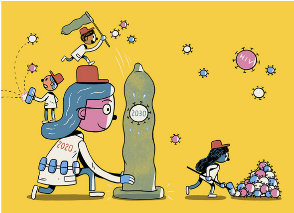
Illustration: Eivind Gulliksen / desillustrert

this year. We believe Norway has reached these targets.