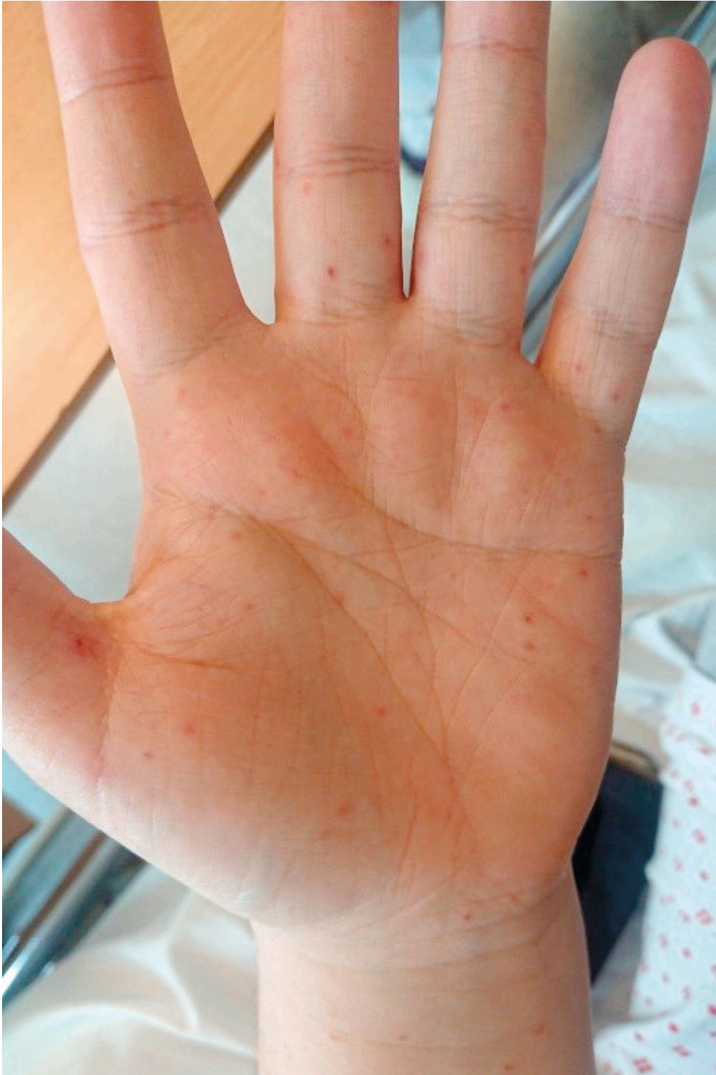
Figure 1 Exanthema on the patient's left palm.

soles of the feet. Clinical examination showed no other abnormal findings. The cause of the symptoms was unclear, and the patient was admitted to the observation ward for further investigation.