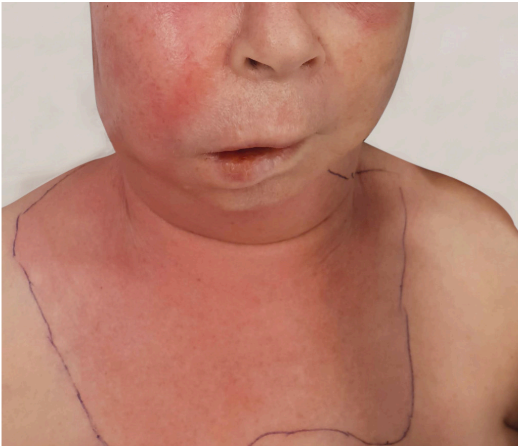
Figure 3 Necrotising soft tissue infection originating from a periapical abscess on an upper right molar.

The condition begins with thrombosis in small blood vessels in the periphery of the focus of infection, leading to acute inflammation and to oedema in subcutaneous tissues and possibly the skin (Figure 3). Necrosis then occurs in the infected tissue. This spreads rapidly along the superficial fascia, nerves, arteries and veins (12) . Left untreated, the majority of patients will develop sepsis within 48 hours (12) . Owing to its rich vascular supply, necrotising fasciitis rarely occurs in the head and neck area, with a reported annual incidence of only 2 cases per 1 000 000 population (12) . The most common cause of necrotising fasciitis in the head and neck area is odontogenic infection, but the condition can also occur secondary to pharyngitis, tonsillitis, acute otitis media and dermatological infections (12) . If an odontogenic origin of necrotising fasciitis is suspected, the patient should be referred immediately to a maxillofacial surgery department or alternatively to the nearest department of otorhinolaryngology or plastic surgery.