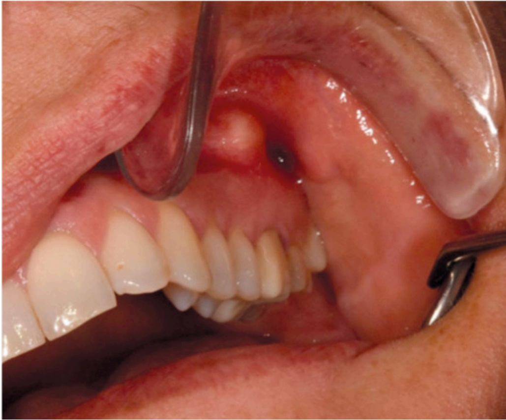
Figure 1 Periapical abscess from upper left molar.