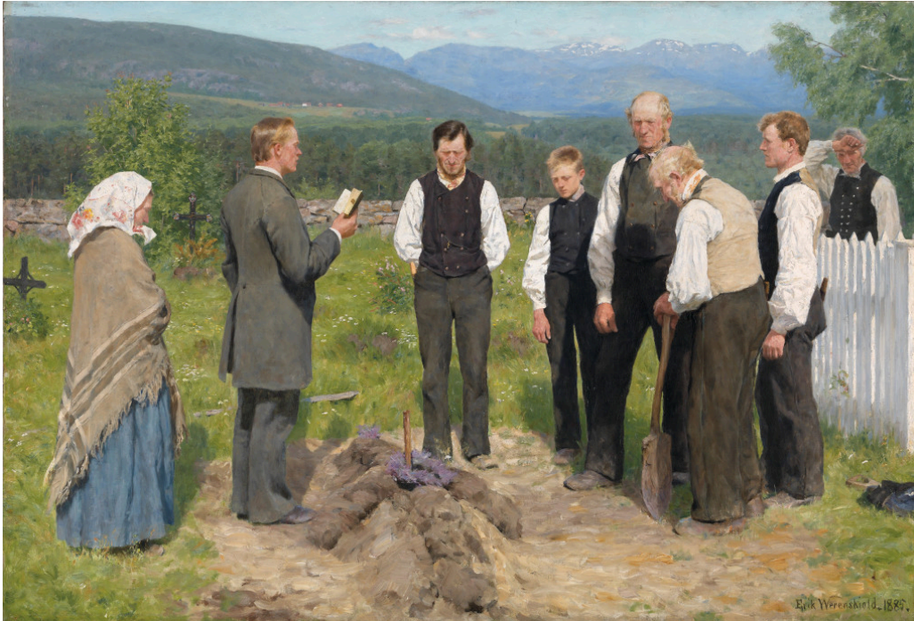
A reminder of the importance of rituals in mourning processes. «Peasant burial» by Erik Werenskiold, 1885.

The psychoanalysts Léon Wurmser and Otto F. Kernberg provide personal accounts of mourning over their spouses, with whom they had shared most of their lives ( 15 ), p. 96; ( 17 ). They believe that Freud devoted too little attention to the opportunities for personal development that a completed mourning process entails, including at an advanced age.