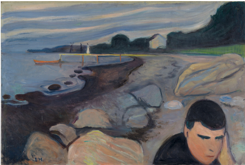
'Melancholia' by Edvard Munch, painted 1892.

Grief is not a disease, but some people nevertheless become ill from grief. Freud was one of the first to attempt to understand why.