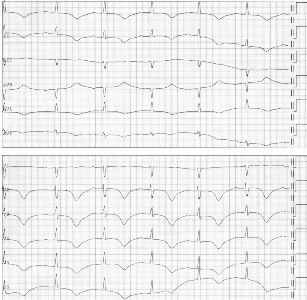
Figure 3 ECG from day 11 showing sinus rhythm but new-onset T-wave inversion in standard leads I, II, aVL and aVF and in precordial leads V2–6. Corrected QT interval 590 ms.

On day 11, the woman again became increasingly dyspnoeic, but without accompanying chest pain. Auscultation revealed crackles over both lungs upon inspiration. ECG showed sinus rhythm, QRS width 97 ms, corrected QT interval 590 ms and a new-onset T-wave inversion in precordial leads V2–6 in addition to standard leads I, II, aVL and aVF (Figure 3). Over the course of the day, she had repeated episodes of rapid atrial fibrillation that were treated with beta blockers. Loop diuretics were administered owing to clinical signs of heart failure.