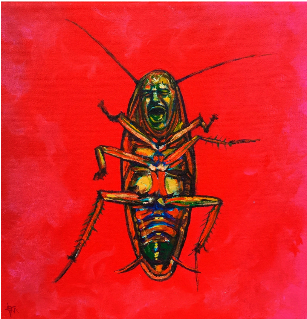
Illustration: Tony Miller

'One morning, as Gregor Samsa was waking up from anxious dreams, he discovered that in bed he had been changed into a monstrous verminous bug.' This is the first line of the famous short story The Metamorphosis by Franz Kafka (1). The insect scenario in the story is absurd, but appeals to a general human fear: what if I should fall ill, what if I should find myself excluded, what if I suddenly should become unable to earn a living? From being the son and main breadwinner in a family of four, Samsa is transformed overnight into 'ein ungeheures Ungeziefer', a monstrous verminous bug.