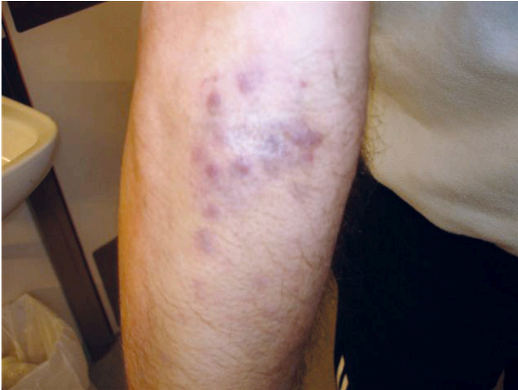
Figure 1 Photograph of the patient's forearm showing purplish nodules in the skin.

biopsies as well as those from the stomach (Figure 2). Both biopsies showed HHV8 (human herpesvirus 8)-positivity. The lymph node biopsy from five years earlier was re-evaluated and deemed also to be consistent with Kaposi's sarcoma (Figure 3). Following the diagnosis, treatment was started with intravenous liposomal doxorubicin. Despite treatment, the disease progressed and spread to the liver, and the patient died just over two years after the diagnosis was made.