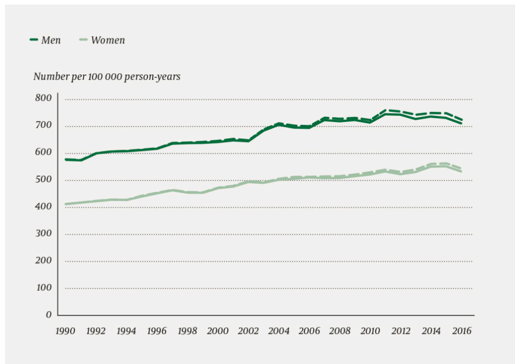
Figure 1 Change in the incidence of all types of cancer among the Norwegian-born (broken line) and in the population as a whole (solid line), shown as age-standardised incidence rates (Norwegian standard) in the period 1990–2016.

Figure 1 shows that the incidence of all types of cancer as a whole increased in the period 1990–2016, among the Norwegian-born as well as in the total population.