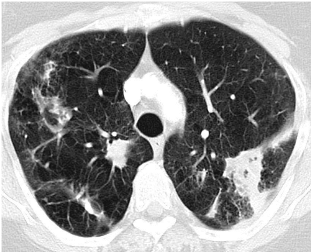
Figure 1 CT thorax of a patient with severe COPD with emphysema. Cavernous and fibrotic changes and infiltrates are seen. There was repeated growth of M. intracellulare in bronchial specimens.