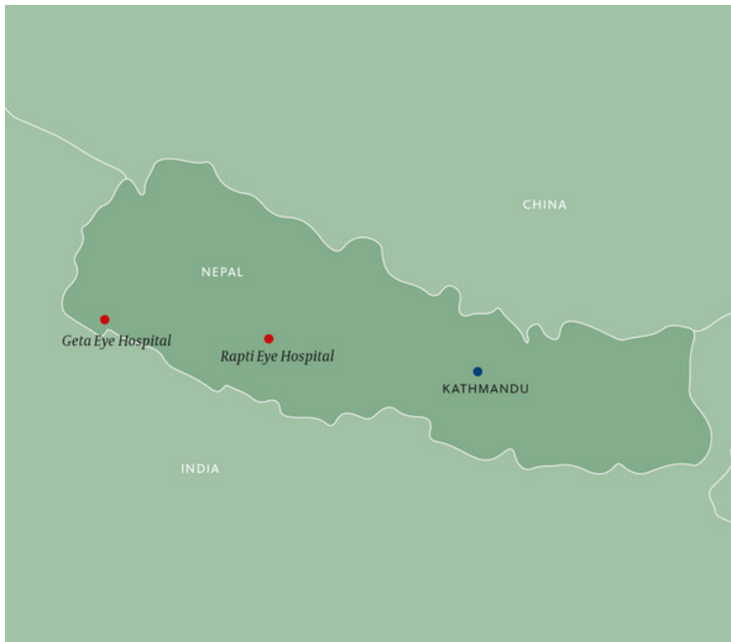
Map of Nepal showing outlying areas

According to the Nepal Ophthalmic Society, in 1981 Nepal had a total of seven ophthalmologists – one per 2.36 million people – and 16 hospital beds dedicated to eye patients. In 2002 there were 100 ophthalmologists – one per 250 000 people – and 16 eye hospitals distributed throughout the country.