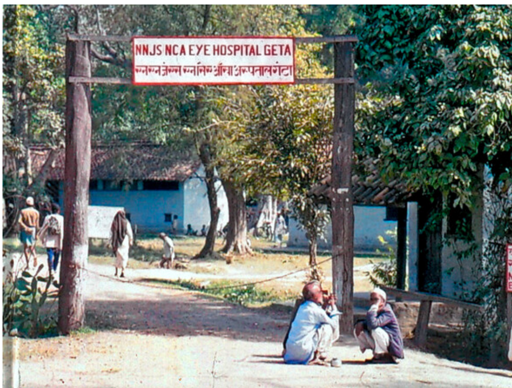
From the entrance gate to Geta Eye Hospital (1985)