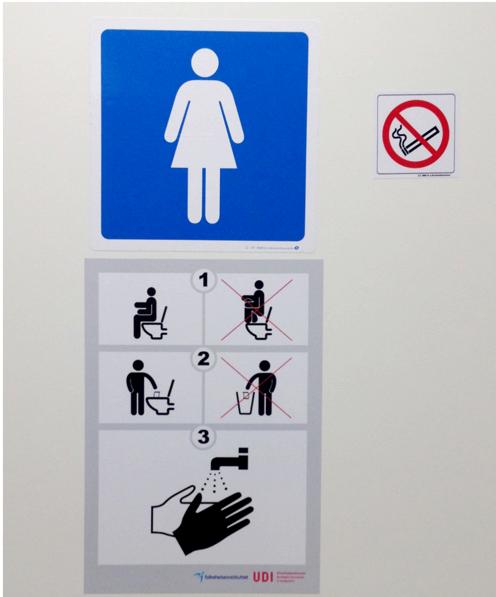
Figure 1 Information on toilet hygiene at the asylum reception centre in Sør-Varanger municipality

diarrhoea. The increasing flow of asylum seekers and scarcity of reception centres in other municipalities quickly exhausted the capacity of the 'Fjellhallen', and a number of hotels in Sør-Varanger were utilised.