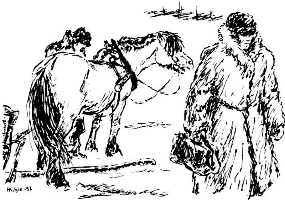
Figure 1 Vesleblakken and the doctor. Illustration by Harald Kihle (1905–97) from 1957. Figure from Thorbjørn Egner's textbook (4, page 155). Illustration © Harald Kihle/BONO

The story is well known. It was reproduced in the school textbooks edited by Nordahl Rolfsen (1848–1928) and Thorbjørn Egner (1912–1990) throughout most of the 20th century (Figure 1) (3–5). The story thus became part of the Norwegian literary canon. The above excerpt is taken from Egner's adapted version (4). It was subsequently omitted from the school textbooks, and the young generation of today is less familiar with the story of Vesleblakken.