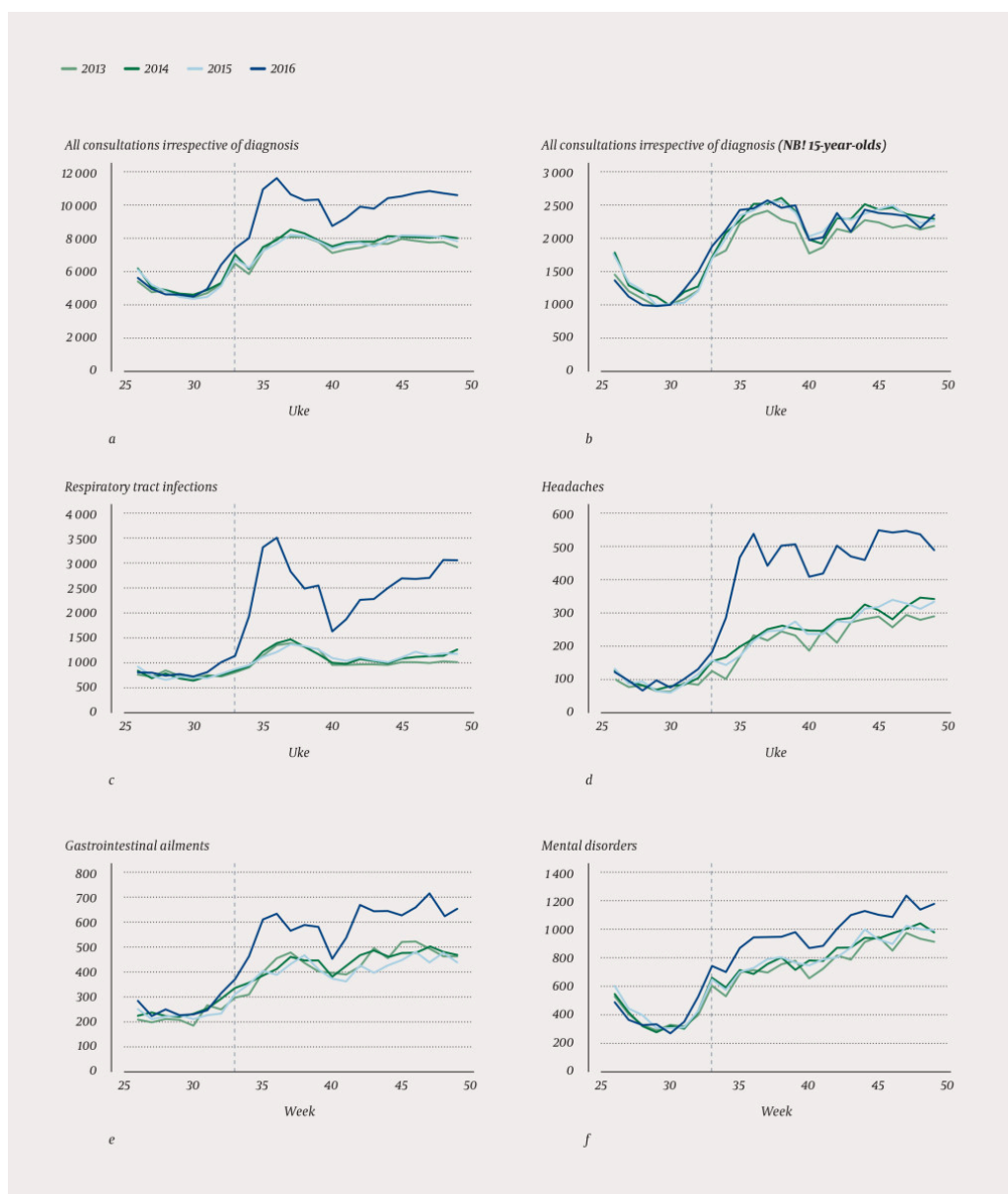
Figure 1 Number of consultations in general practice per week in the years 2013 – 16 (age group 16 – 18 years unless otherwise specified). a) All consultations. b) All consultations in the age group 15 years. c) Respiratory tract infections. d) Headaches. e) Gastrointestinal ailments. f) Mental disorders. The dotted line marks week 33, generally the week when the school year starts (mid-August).

Respiratory tract infections constituted the most frequently occurring diagnosis group (Table 3, Figure 1c). During the period 2013 – 15, the number of consultations for respiratory tract infections remained consistently below 1 500 per week, while a significant increase was seen in 2016, with 3 492 as the highest number recorded in week 36. The consultation rate for respiratory tract infections was 23.2 per 100 persons in the autumn of 2016, compared to 10.5 per 100 in the preceding year, equal to more than a doubling (IRR 2.21, 95 % CI 2.17 – 2.25), see Table 3.