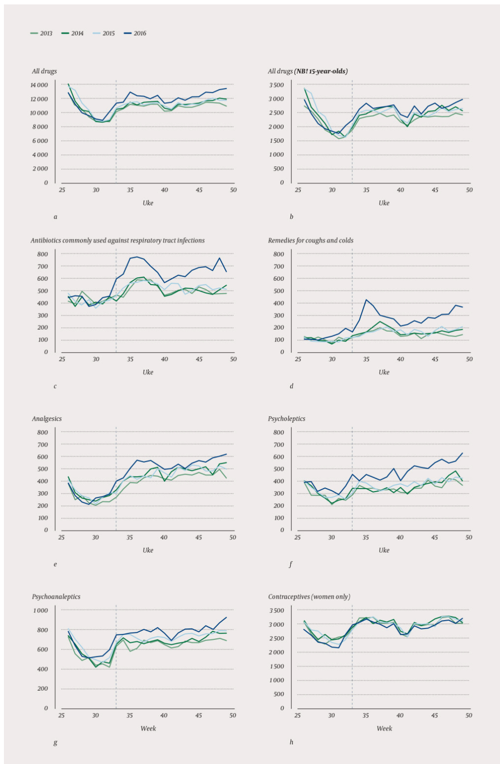
Figure 3 Dispensing rate for prescription drugs per week in the years 2013 – 16 (age group 16 – 18 years unless otherwise specified). a) All drugs. b) All drugs in the age group 15 years. c) Antibiotics commonly used against respiratory tract infections. d) Remedies for coughs and colds. e) Analgesics. f) Psycholeptics. f) Psychoanalectics. h) Contraceptives. The dotted line marks week 33, normally the week when the school year starts (mid-August).

The dispensing rate for drugs in the analgesics group (ATC code N02) was also higher in the autumn of 2016 when compared to previous years (Table 3, Figure 3e), and this also applied to psycholeptics (ATC code N05) (Table 3, Figure 3f). As regards the psychoanalectics group (ATC code N06), an increase may seem