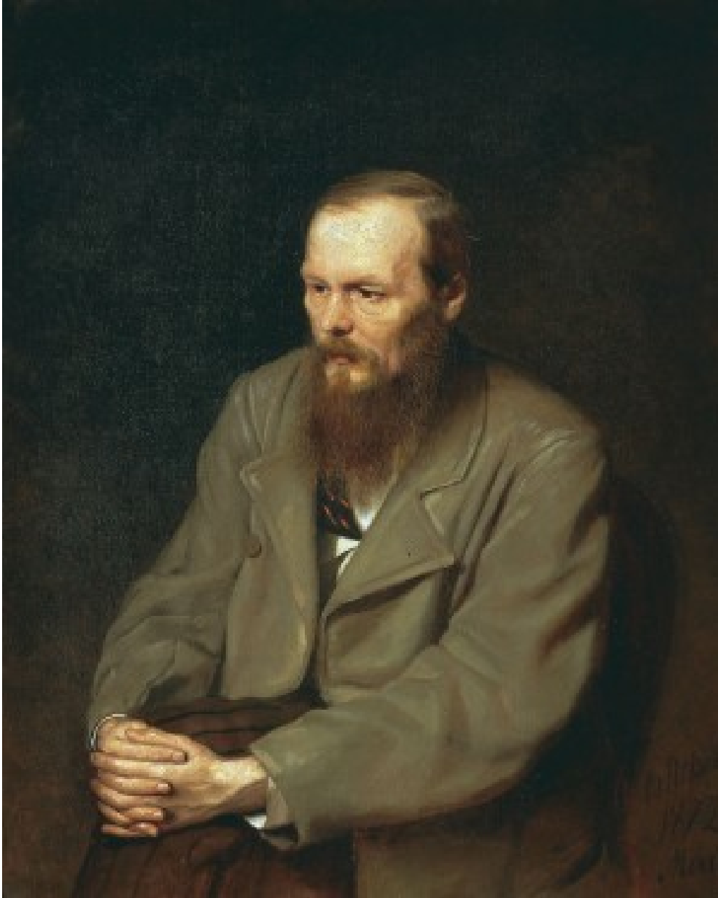
Figure 2 Fyodor M. Dostoyevsky (1821–81) suffered from epilepsy and the disease was a topic in many of his books. Portrait by Vasily Perov, 1872.

never diagnosed during his lifetime, and the diagnosis is based on his diaries and novels, as well as statements from general practitioners who examined him (9).