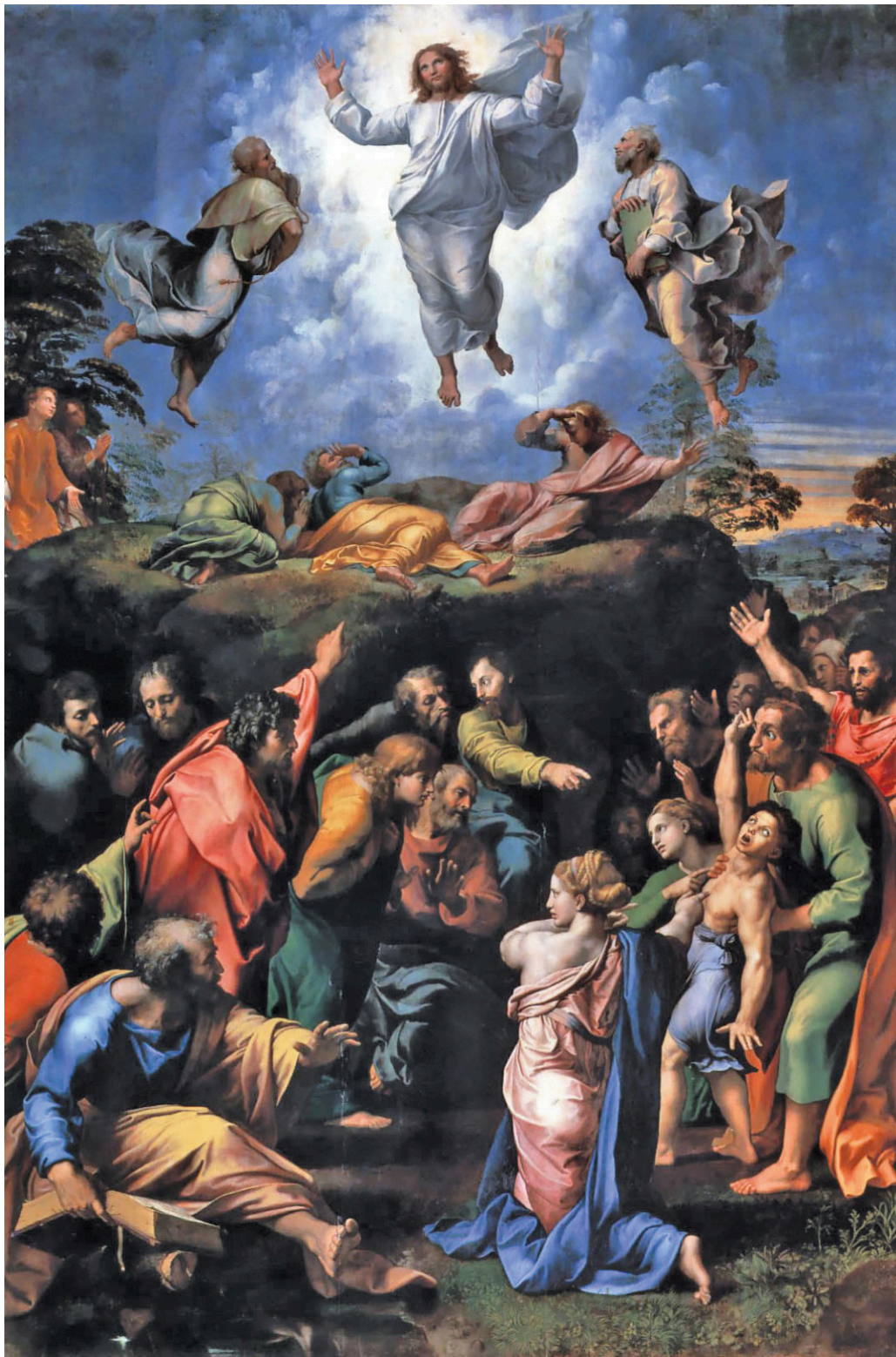
Figure 1 The transfiguration (1500) by Raphael illustrates two scenes from the New Testament: Jesus revealing his divine nature on Mount Tabor and the 'lunatic' boy having an epileptic seizure.

The association between sin and the act of falling reappears in The Divine Comedy (1308–21) by the Renaissance author Dante Alighieri (1254–1321). It describes the author's imagined descent into Hell, Purgatory and finally his ascent to Paradise. On the journey, Dante falls to the ground three times, perhaps exactly symbolising his incomplete morality.